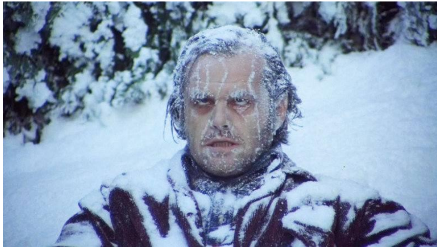
"The Shining." IMDb, IMDb.com, www.imdb.com/title/tt0081505/mediaviewer/rm4166679040 .